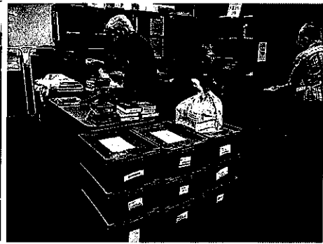
New transit process